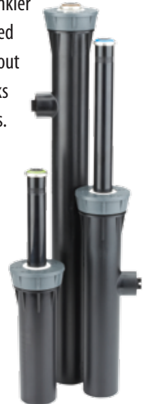
Shrub model not shown.

Built-in regulator set at 40 PSI • New easy-to-identify gray cap • Factory-installed drain check valve